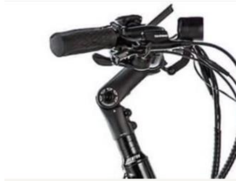
Standard Bicycle Stem