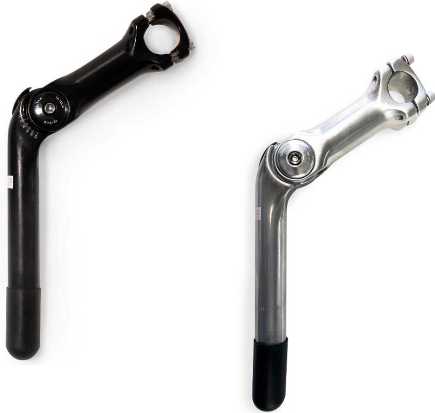
Three Adjustment Points with 4 Bolt Clamp and All Rust Resistant Hardware