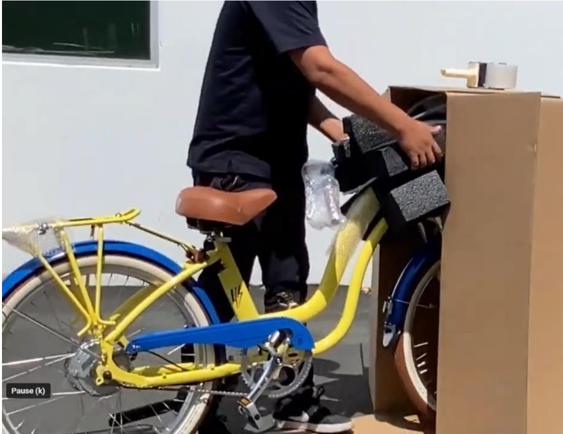
Electric Bike Company