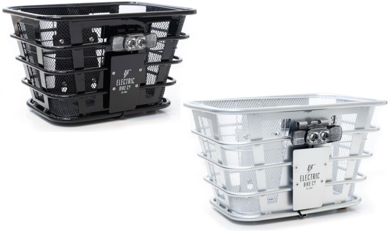
Electric Bike Company

Baskets Attach to Unique Modified Headset to Insure Steering and Bike Handling are Never Compromised ✓